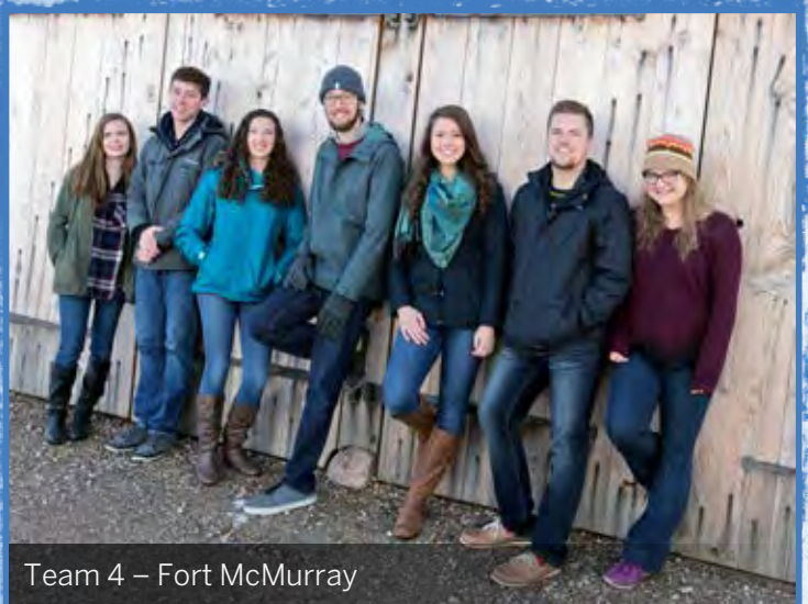
Team 4 – Fort McMurray

Local teams were stationed in Fort McMurray and Calgary and this year the western office has added a local team to work in the BC Lower Mainland. All of this will help increase the number of