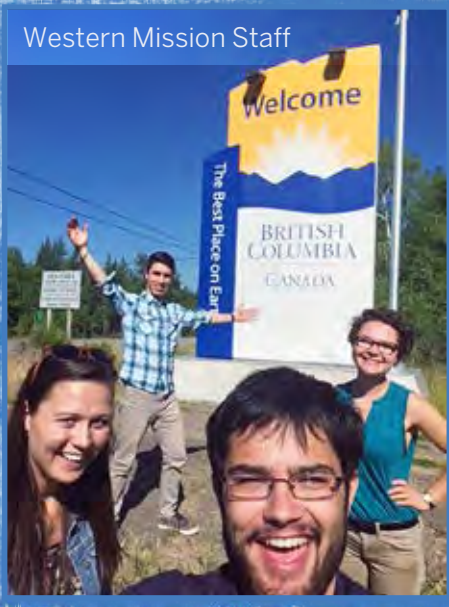
Western Mission Staff