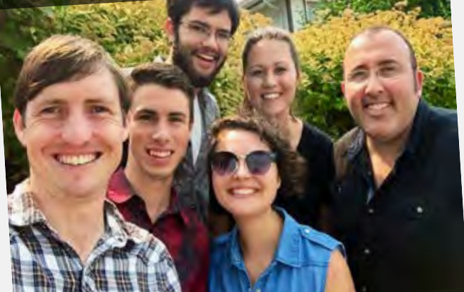
Vancouver Office Staff